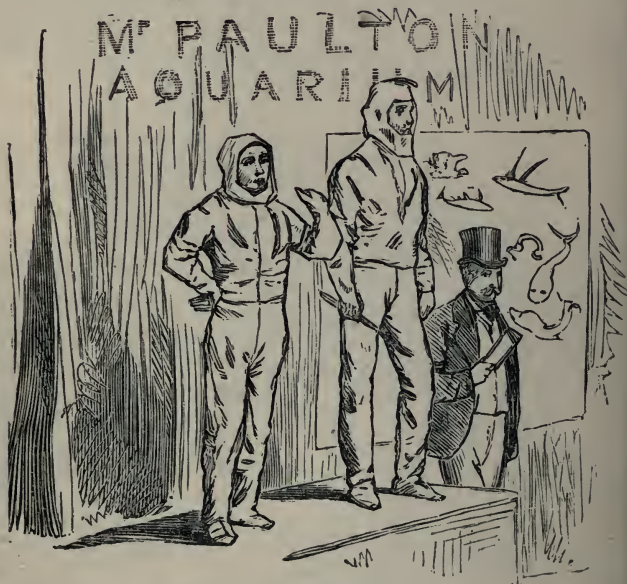
What they said at Bartholomew Fair.