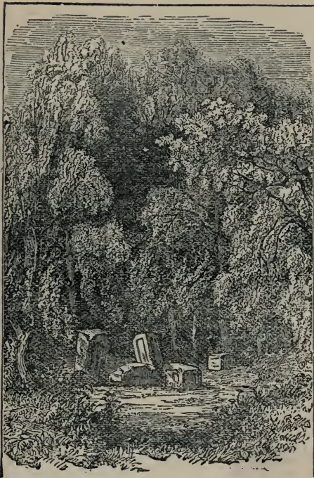
THE PLAYERS IN HAMLET.

THE original "Hamlets" were Joseph Taylor and John Lowin, from the former of whom, taught by Shakespeare, Davenant is said to have instructed Betterton to perform so admirably as he did. His most eminent successors have been Garrick, Henderson, J. P. Kemble, Young, and Kean; whilst Booth appears to have surpassed all others as the "Ghost," unless it were Shakespeare himself, who is recorded to have performed it. In 1771, Garrick produced this tragedy at Drury Lane, all the parts being sacrificed to that of "Hamlet." It is said that the play of Hamlet was thrown into Garrick's grave by the desire of his widow; but after his death the original was restored, and the modern adaptation is that by J. P. Kemble, brought out at Drury Lane in 1800, and at Covent Garden in 1804.